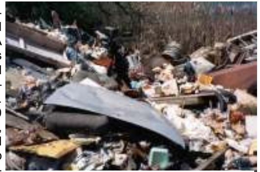
PACW was recognized for its work helping to clean sites like this, one of Lawrence County's largest known sites.

Cleanups and other programs are organized and supported locally through PA CleanWays chapters. There