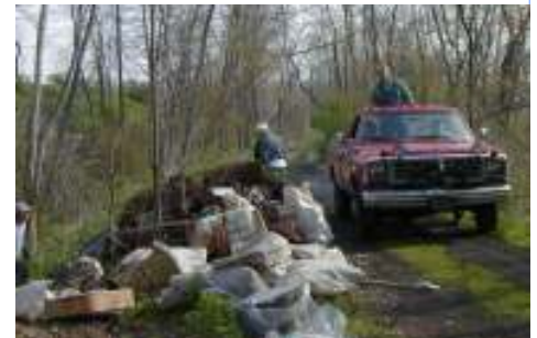
Last year's cleanup in action

A situation involving illegal dumping that is becoming more common occurs with the purchase of a new property, especially in rural areas. This was the case when Alice Sankey moved into her Wilmington Township home 13 years ago. Alice never imagined what lay beneath the snowy hillside on her property. Out of the melting snow, a dump site emerged. Alice found out about the PACW program, and as a result was able to get help with her problem. This will be a normal one-day cleanup due to the size of the site.