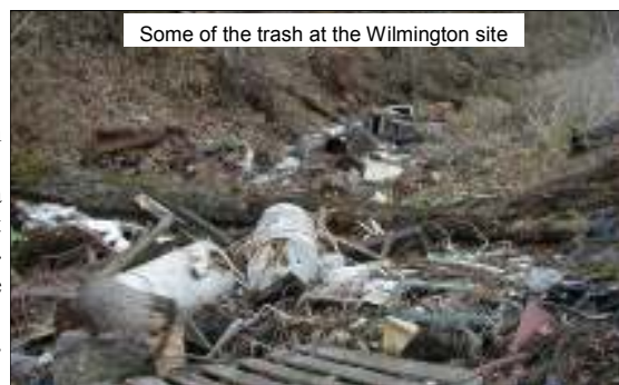
Some of the trash at the Wilmington site

Special Notes: This site is located alongside the old railroad bed between Allen Road and Fayette-Neshannock Falls Road. It is an older site that has been inactive for some time. Last year, however, the Lawrence County Recycling/Solid Waste Department observed new dumpings that have occurred. The newer material consisted mostly of construction material and yard waste.